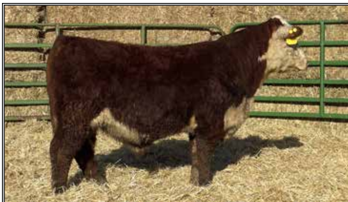
RB SMOKER 67L