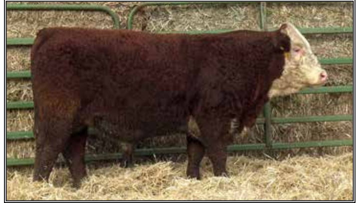
RB SIR HOME RAISED 25L

• Some of the most used horned genetics in the breed. L1 Breeding, Low PAP 41.