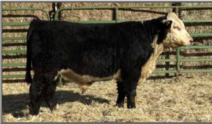
RB RIGHT WAY 74L

• This bull was a standout as a calf. He was the second heaviest weaning weight out of a great cow family. Low Low PAP of 34.