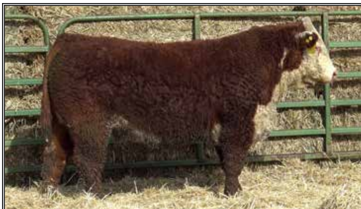
RB HOME GROWN 37L