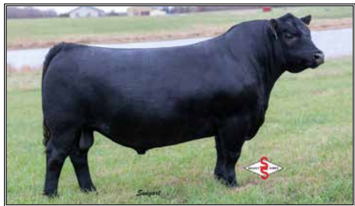
BIGK/WSC IRON HORSE 025F