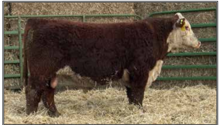
RB OVERTIME 31L