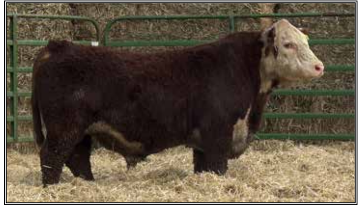
RB OVERTIME 38L