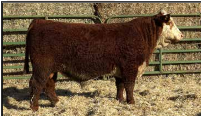
RB ZORRO 64L