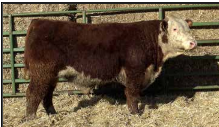
RB SAMMY 9L