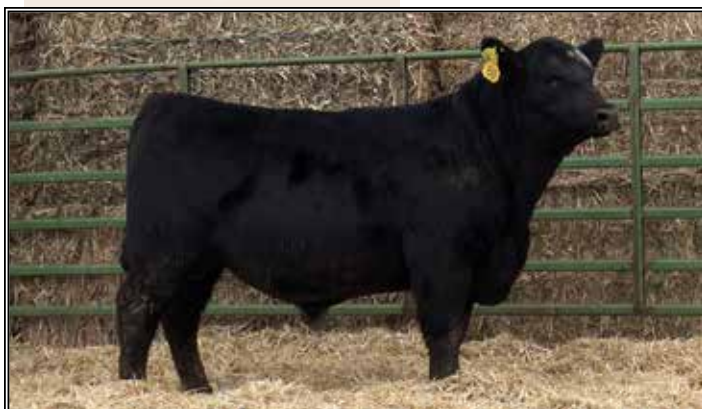
RB CAPTAIN 33L