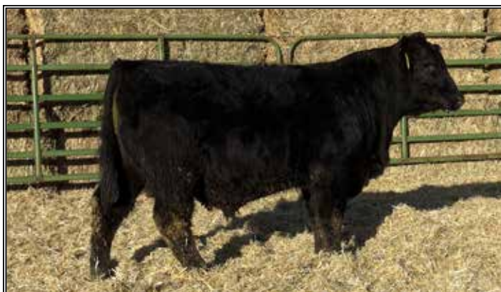
RB LOCKED IN 21M