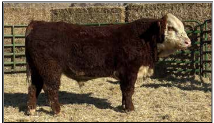
RB TESTED 46L