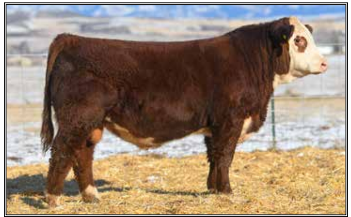
CHURCHILL BROADWAY 858F — Sire of Reference Sire F

Zorro was used to clean-up on some heifers then ended up getting injured. We were able to get two sons out of him that are in the offering. A Broadway son with lots of pigment out a great Mandate daughter we purchased from Cache Cattle in Logan, Utah.