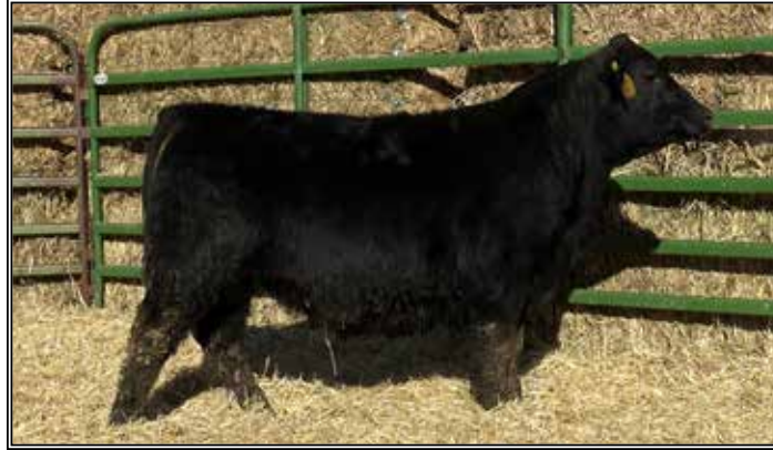
RB CAPATAIN 31M