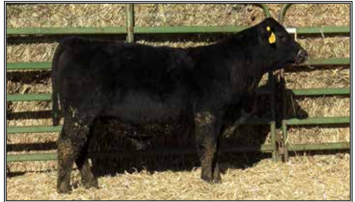
RB IRON CLAD 15M

• Out of a first calf heifer and proven genetics on both sides here. Bid growth! BW 68 lb.