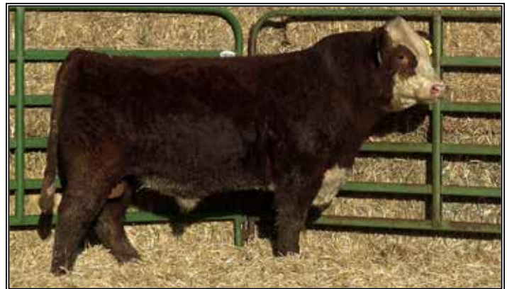
RB SIR TESTED 33L

• Loads of pigment, dark color, BW 62 lb. and a PAP at 41 make this bull an attractive option, especially considering his dam. She is good!