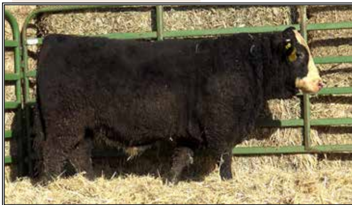
RB BALD FACE 931L