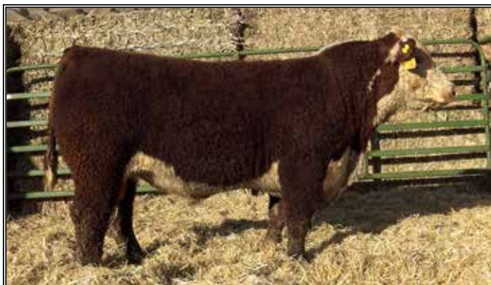
RB MOVE ON 1L