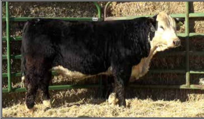
RB RIGHT WAY 69L