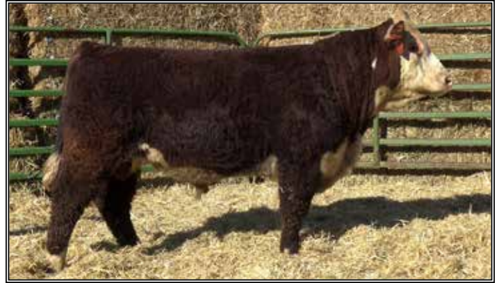
RB ON TIME 11L

• Dark made bull with some class. Stout, square hipped with a PAP of 41.