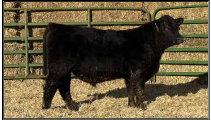
RB SIR EX 13M

• Attractive Exclusive son with a great dam behind him.