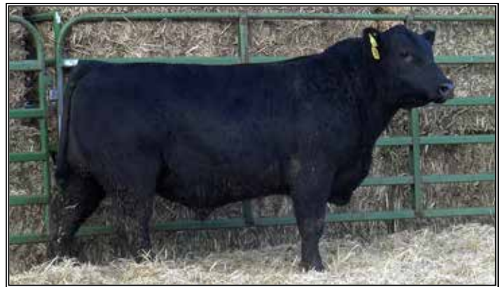
RB CAPTAIN 16L

• Big bodied sure footed bull with a great Marda daughter as his dam. YW EPD over 130.