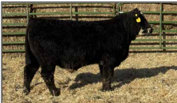
RB SIR BALDIE 640M