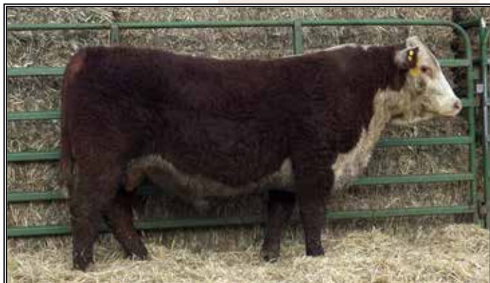
RB MOVE ON