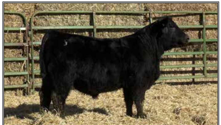
RB CAPTAIN 26M

• Capitalist and Aviator mating here. Proven solid genetics on both sides. Low BW of 82 lb.