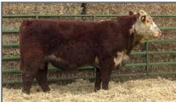
RB OVERTIME 21L