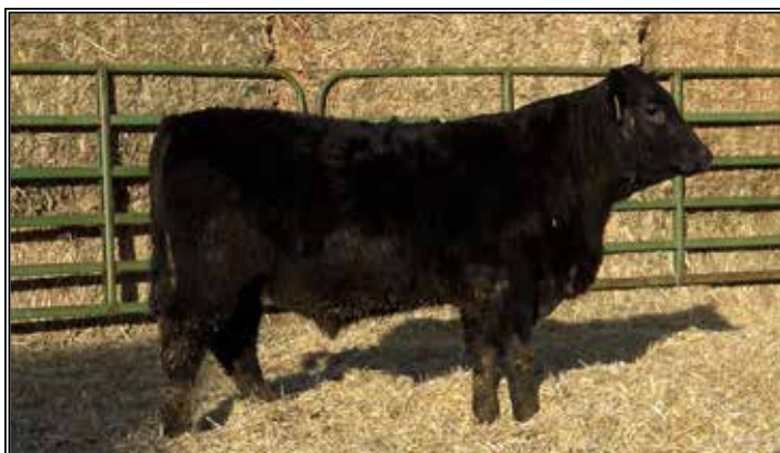
RB SIR LOCKED IN 18M