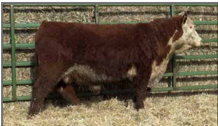
RB HOME BRED 63L

• Big growth out of a top cow. Big hiped, deep ribbed with sound feet. Don't miss him. PAP at 41.