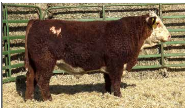
RB OVERTIME 60L