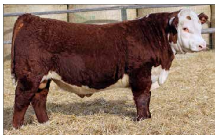
NJW 16C Z115 SPOT ON 74G ET —Sire of Reference Sire B

This bull was our pick from Churchill's program in 2022. His genetics are a unique outcross for most Hereford breeders. He is big bodied and thick down his top. He weaned off his momma at 863 lb. His maternal side is also a solid foundation of some very powerful females. Lots of maternal and lots of carcass in this bull.