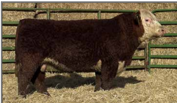
RB SMOKE 8L