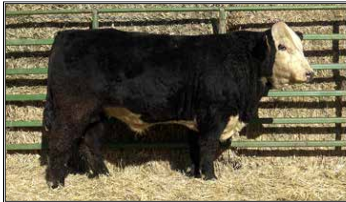
RB SENSATION 2