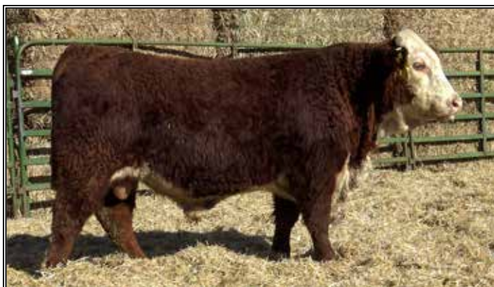
RB HOME RAISED 51L