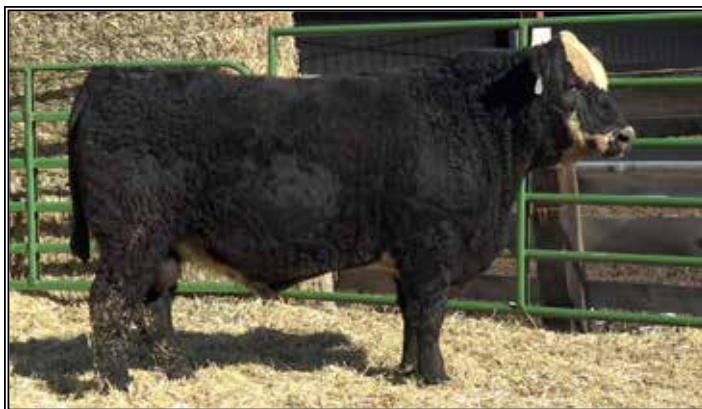
RB BROCKEL FACE 073L