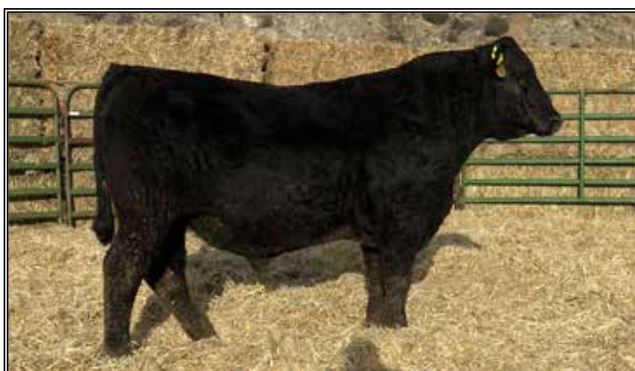
RB RIDGE 25L

• Moderate frame with thickness. Act. BW of 70 lb. Out of a good proven cow. Low PAP 38.