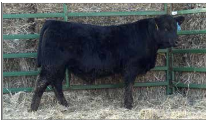
RB CAPTAIN 30M