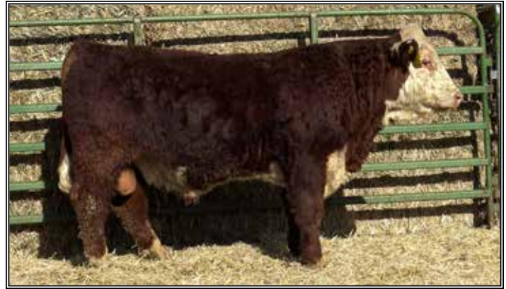
RB SIR TESTED 42L

• Dark made with lots of growth. Act. BW 78 lb. Out of a favorite cow.