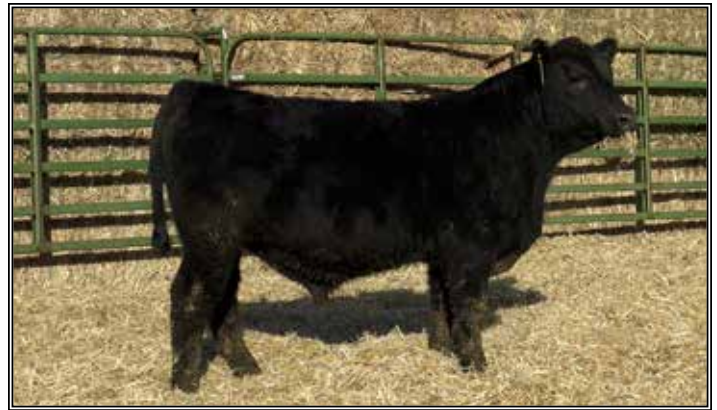
RB IRON CLAD 16M

• A very good Outcross option for those heifers. Act. BW 64 lb. Out of a great Whitlock daughter.