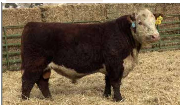
RB OVERTIME 49L