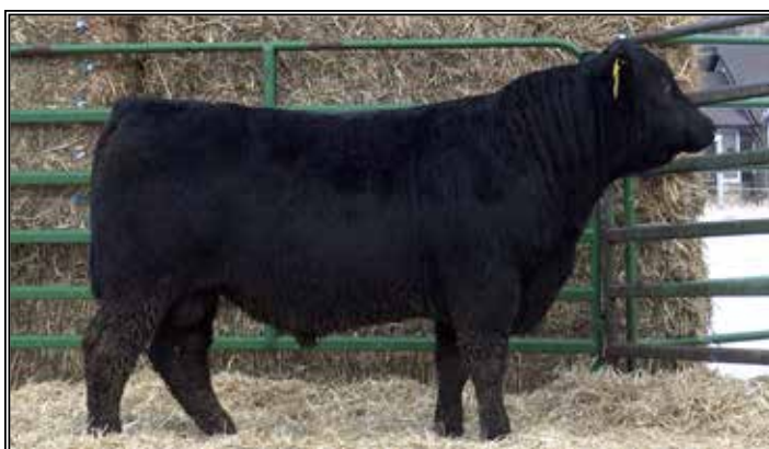
RB RYDER 24L

• Big YW EPD 139. Stout made kind. He will add growth in your program. PAP 41.