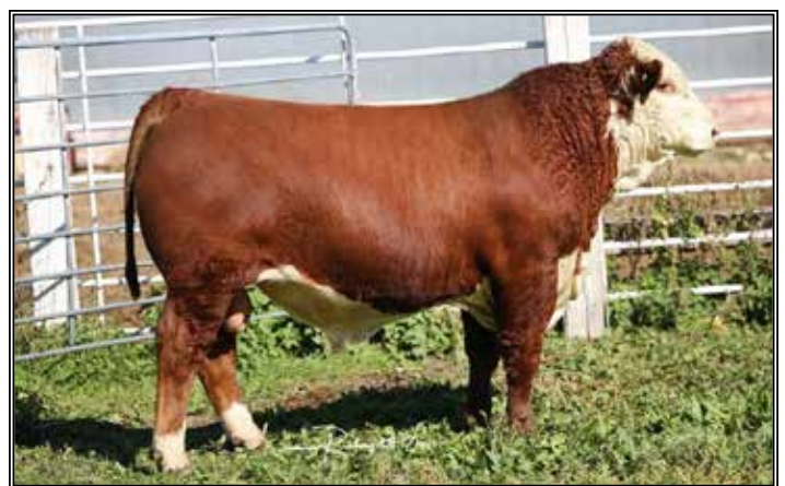
OBH BEEF 462H

Homozygous polled, big weaning and yearling EPDs. Weaned off his dam at 803 lb. His dam with a fantastic udder. Son of the 4013 bull. High performance cattle with extra volume.