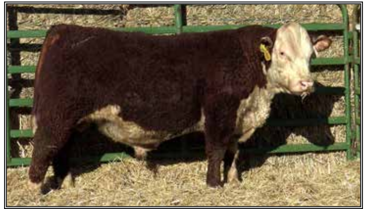
RB RECOIL 30L

• Big CHB on this bull. Great pattern. Out of a great dam! PAP of 39.