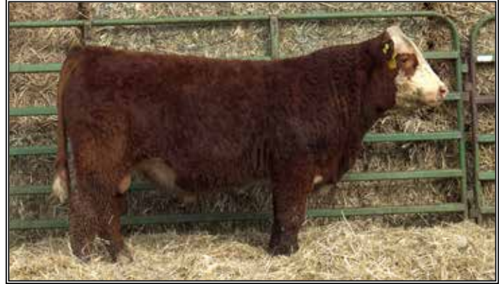
RB TEST 40L