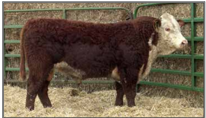
RB SIR HOME RAISED 7L

• This horned "Uncle Sam" son has plenty of grow in him, out of a Holden bred dam. PAP of 39.