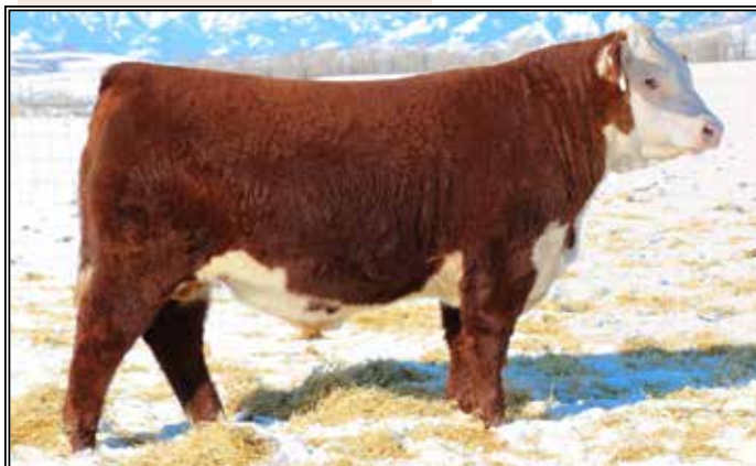
CHURCHILL GUNSMOKE 111J ET