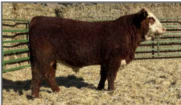
RB TEST 6L