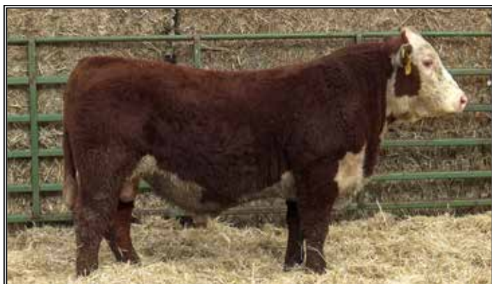
RB RECOIL 12L