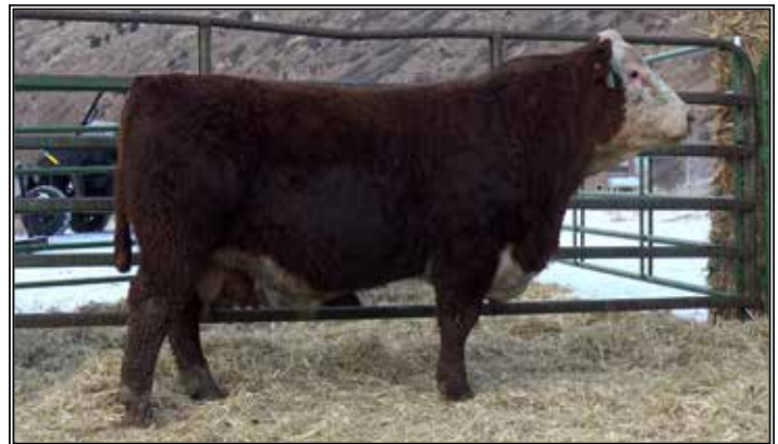
RB OVERTIME 44L