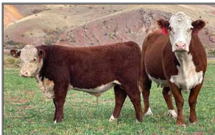
RB 237 ON CALL 11J — Pictured as a calf

A home raised Spot On son out of a top cow raised here at Rees Brothers Ranch. Big hiped and deep flanked. This calf was a standout since birth with the top weaning index of the 2022 calf crop. His dam has a perfect udder still at age 13 and is a donor cow in our program. She has weaning index of 109 on 11 calves.