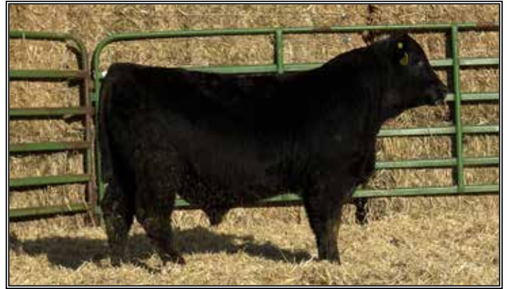
RB SIR MARDA 23M

• Another Whitlock son that won't disappoint. Out of a 12-year-old dam that keeps performing.