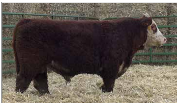
RB HOMESTEAD 43L