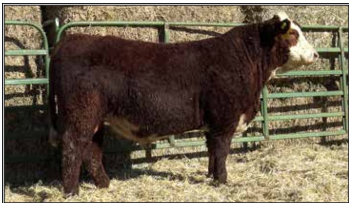
RB SIR TESTED 58L