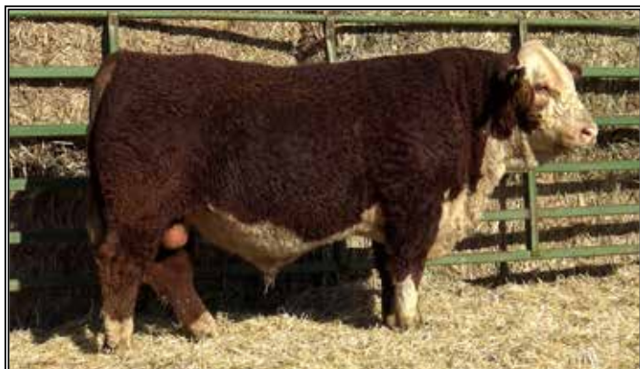
RB ON TIME 36L