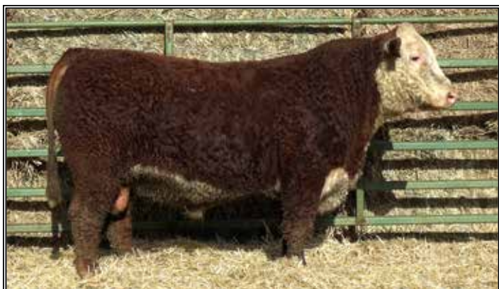
RB OVERTIME 10L