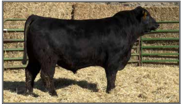
RB EXCELL 13L

• Low birthweight EPD. Act BW of 66 lb. Out of a very beautiful cow that raises a good one every year.