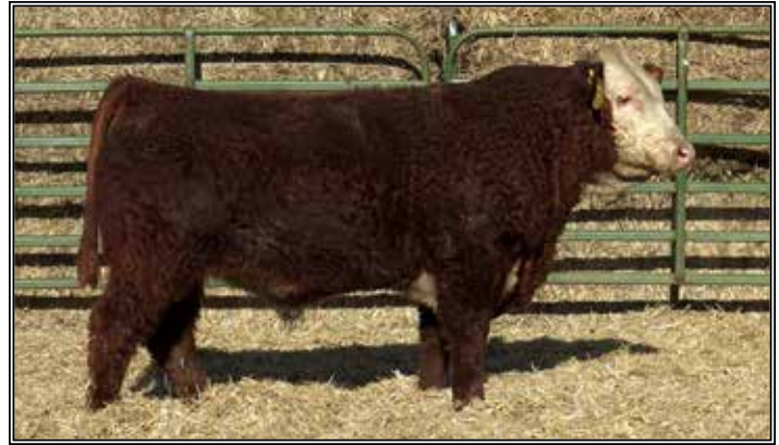
RB EXPEDITED 19L