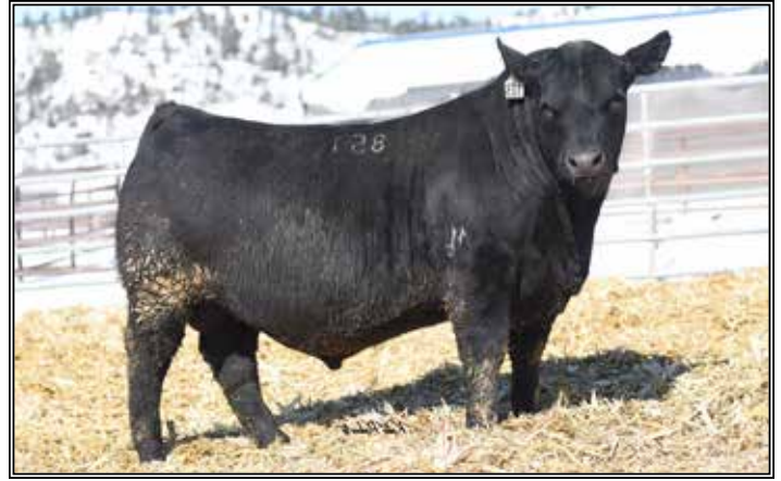
MARDA WHITLOCK 857