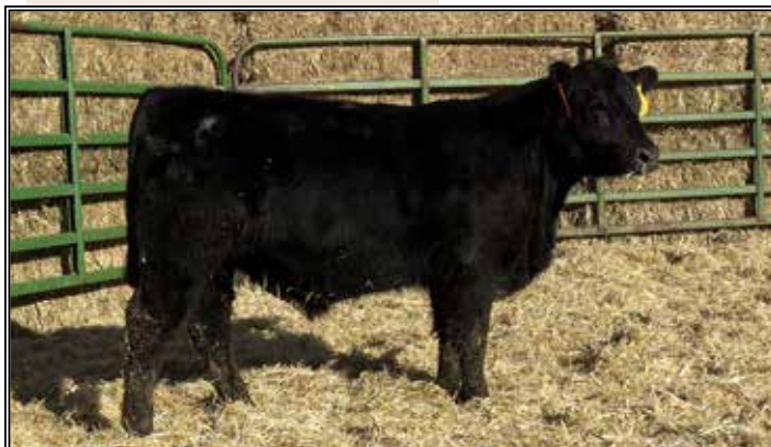
RB IRON CLAD 17M