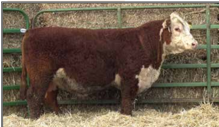
RB SMOKER 54L