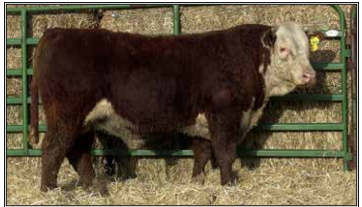
RB HOME RUN 16L

• Horned pedigree from Harrells program in Oregon. Growthy stout made kind of a bull. Super low PAP of 34.