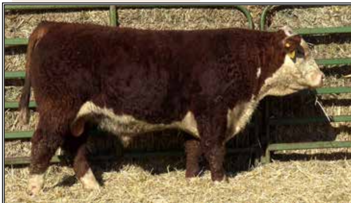
RB HOME RAISED 26L