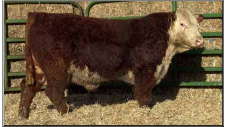
RB REVIVED 50L