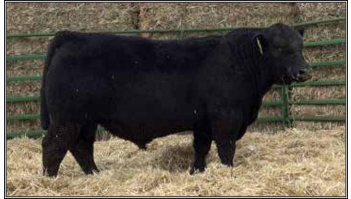
RB RIDGE 6L

• Another possible calving ease option with the low BW EPD and low PAP for those high elevations. PAP 36