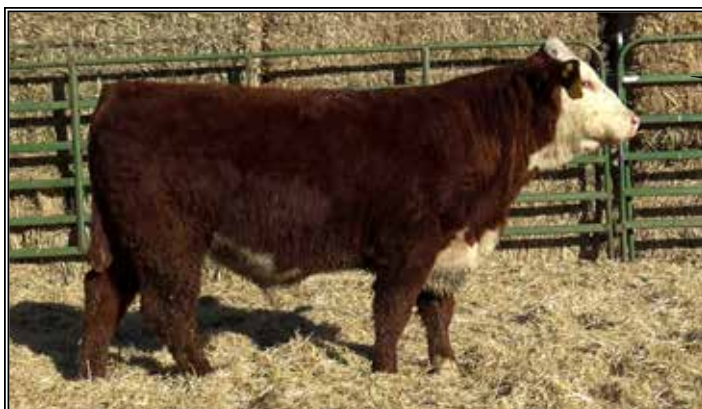
RB SIR SMOKE 71L