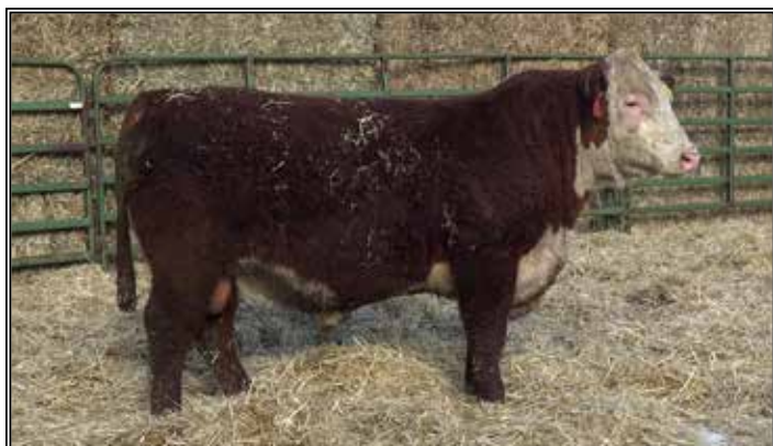
RB MOVE ON 48L