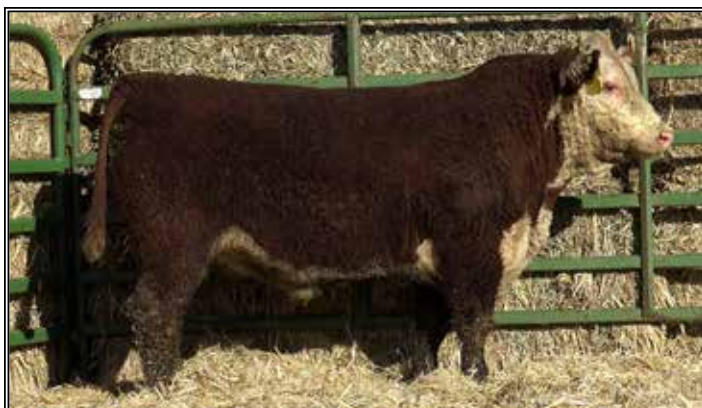
RB NORMAN 45L