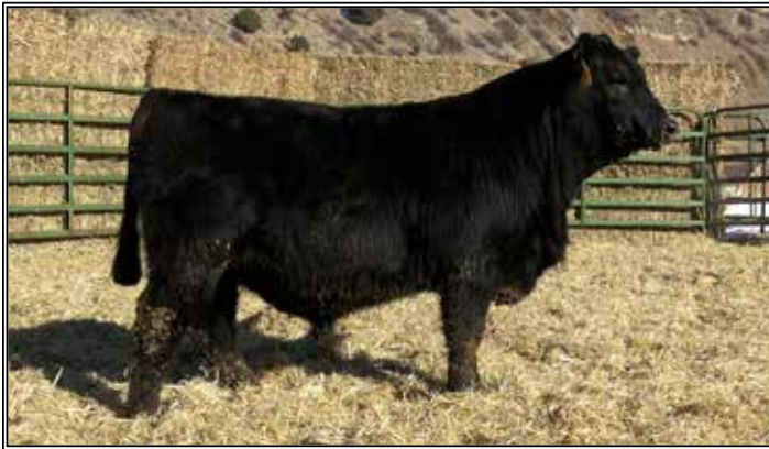
RB LOCKED IN 2M