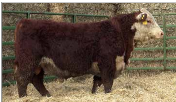
RB OVERTIME 29L